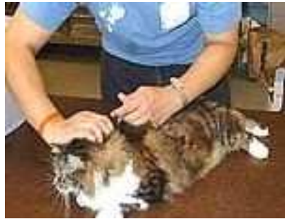
A cat being microchipped by a vet.